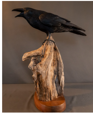
First Place Intermediate Level: Rita Tulloh of Epping NH