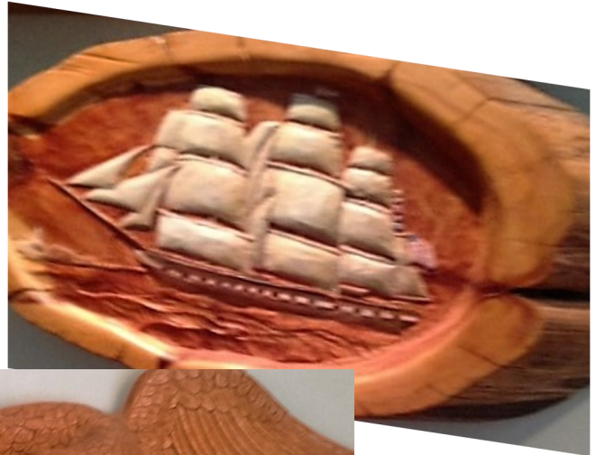
Carving at a NEWC meeting